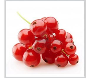
Red Currants BIX Item #2290 Pack Size: 12/6 oz.