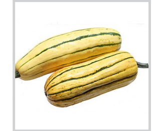
Delicata Squash BIX Item #8260 Pack Size: 20 lbs.