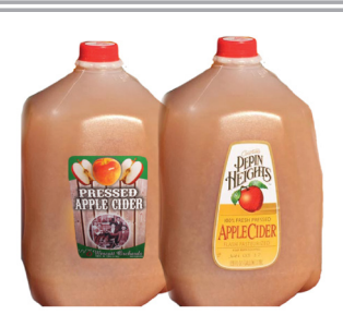
Apple Cider Local MN Cider BIX Item #94020 4/1 Gallons BIX Item #94025 1 Gallon