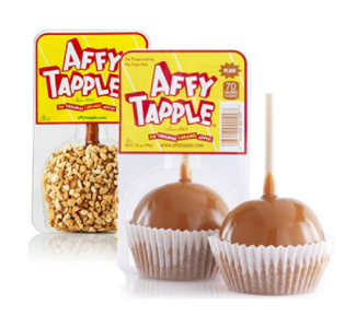
Caramel Apples Original #60560 w/ Nuts #60520 24 count *Available for special order*