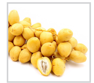
Fresh Bahri Dates BIX Item #2517 Pack Size: 30 lbs.

Call your BIX rep for current availability and pricing for these special order items