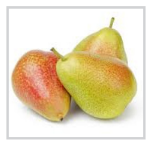
Forelle Pears BIX Item #3720 Pack Size: 120 ct