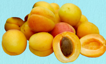
Apricots #2080 72 count