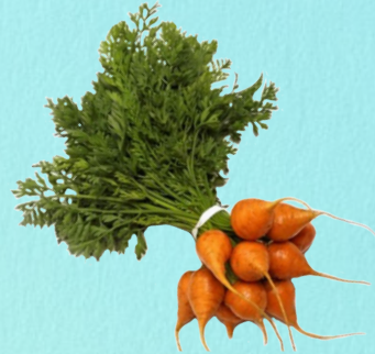
Baby Thumbelina Carrots #4121 24 count