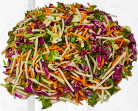
Power Slaw with Kale #15934 - 4/2 lbs. Broccoli, carrot, kohlrabi, brussel sprouts, red cabbage, kale