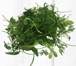
Seafood Micro Blend #438 - 4oz. Sorrel, Chervil, Scallion, Dill