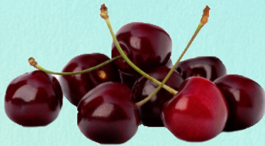
Sweet Cherries #2450 16 lbs.