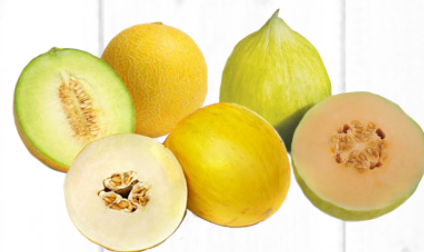
Variety Melons Crenshaw #3180 Galia #3310 Juan Canary #3300 6-8 count