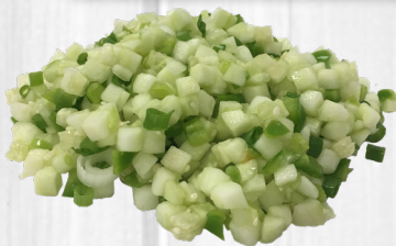
Veg Mix Gazpacho #18395 - 5 lbs. Diced cucumbers, green peppers, green onions

Use BIX Fresh Cuts for Summer Gazpacho and Giardinara Recipes!