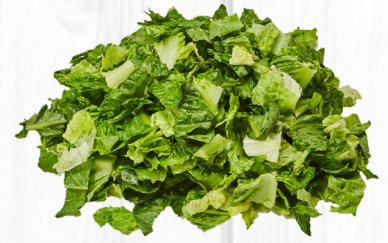
Torn Romaine Shredded Romaine #15711 - 6/2 lbs. #15688 - 6/2 lbs.

Use BIX Fresh Cuts for Summer Gazpacho and Giardinara Recipes!