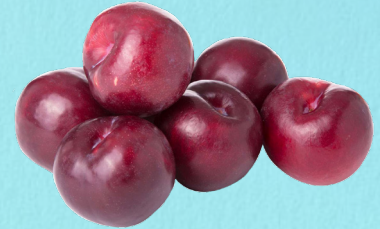
Red Plums #3850 40-50 count