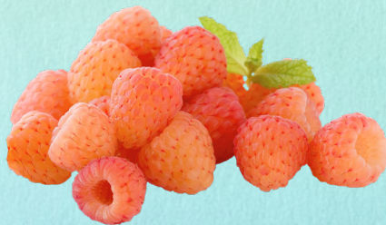
Sunshine Berries #2350 12 count

4 c Chopped Kale (#12535) 1/4 c Sunshine Berries (#2350) 1/4 c Golden Raisins (#32100) 3 T White Balsamic (#64727) 2 T Toasted Pecans (#31860) 2 oz. Cranberry Chevre Cheese (#81795) Salt and Pepper to Taste