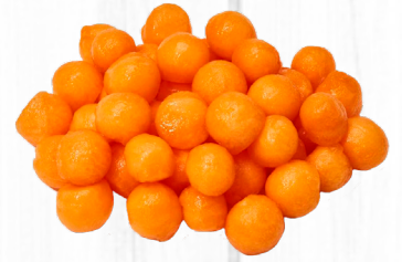
Fruit Balls Watermelon #12319 Honeydew #12129 Cantaloupe #12064 5 lbs.