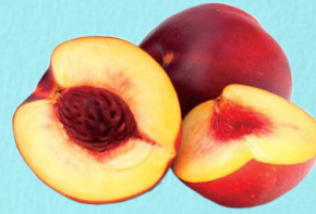
Nectarines #3380 60-64 count