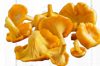
Gold Chanterelle Mushrooms (SO) #6115 1 lb.