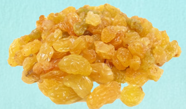
Golden Raisins #32100 5 lbs.