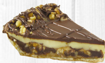
The Big Blitz Snickers Pie #52606 28 slices