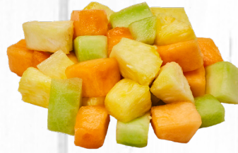
Fruit Chunk 1" Pineapple #12300 Honeydew #12150 Cantaloupe #12090 5 lbs.