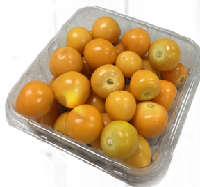
Golden Berries #2313 12/6 oz.