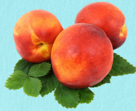
Peaches #3600 24 lbs.