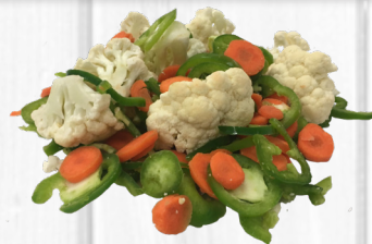
Veg Mix Giardinara #18404 - 5 lbs. Cauliflower buds, jalapeno peppers, carrot coins

Blend all ingredients until well combined but slightly chunky. Chill for 2+ hours before serving.