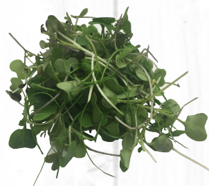
Meat Micro Mix #430 - 4oz. Red Mustard, Scallion, Kale, Red Pak Choi

Grown locally in Baldwin, Wisconsin, these micro blends were created by our BIX team and are exclusive to BIX.