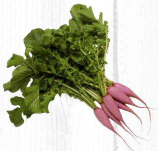
Purple Ninja Radish #7760 24 count