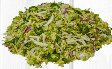
Taco Slaw Blend Julienne #17134 - 5 lbs. Napa shred, radish, red onion, jalapeno, cilantro