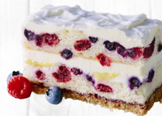
Summerberry Stack #52626 64 slice