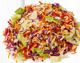
Thai Salad Mix #15920 - 2/5 lbs. Plain lettuce, red pepper, plain cabbage, carrot, red cabbage