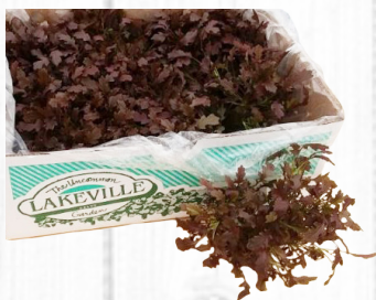
Firecracker Mizuna #4186 1.15 lbs.