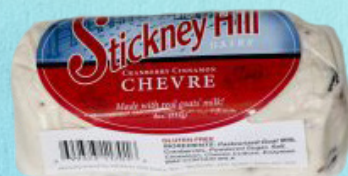
Cranberry Chevre Cheese #81845 12/4 oz.