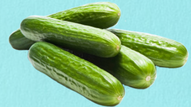
Persian Cucumbers #4973 12 count

Use Sunshine Berries for a fresh summer salad recipe!