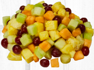
Fruit Chunk Mix w/ Grapes #12210 - 5 lbs. Grapes, honeydew, cantaloupe, pineapple