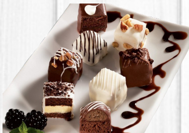
B&W Petit Fours #57024 144 count