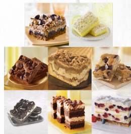
EZ8 Variety Bars (Sliced) #52591 66 bars