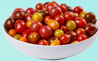
Gourmet Medley Tomatoes #8893 10/12 oz.