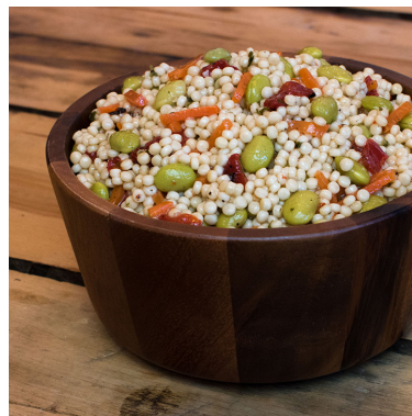
Thai Couscous Salad from Mrs. Gerry's #20156 - 2/5 lbs.

Ingredients include: chicken, organic onion, egg noodles, organic carrots, organic celery, sea salt, sunflower oil, garlic, seasoning and spices