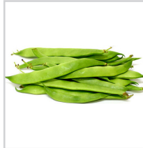
Romano Beans #4335 15 lbs.

Closely resembling an apple, in size and shape, this fruit has a thin, edible skin. The creamy colored flesh is very sweet and custard-like and tastes similar to a banana and pear.