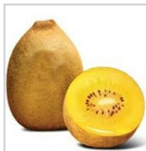
Gold Kiwi #2805 27 count

Place orders by Monday for delivery the following Tuesday