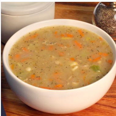
Tuscan Chicken Noodle Soup From At Last! #52619 - 4/4 lbs.

Ingredients include: chicken, organic onion, egg noodles, organic carrots, organic celery, sea salt, sunflower oil, garlic, seasoning and spices