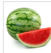
Baby Watermelon #3325 6/8 count

Golden kiwis is typically smaller in size and carries a far sweeter flavor than the tart flavor of a green kiwi. Golden kiwis can be treated and prepped as the traditional green kiwi would.