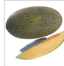
Hami Melon #3265 11 count

Romano beans are wide and flattened, averaging about five inches in length. The beans are crisp and fleshy in texture and offer a subtlety sweet and nutty flavor.